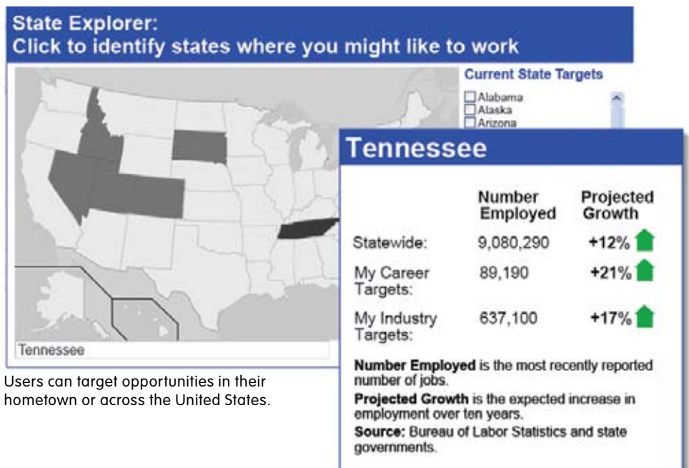
Users can target opportunities in their hometown or across the United States.