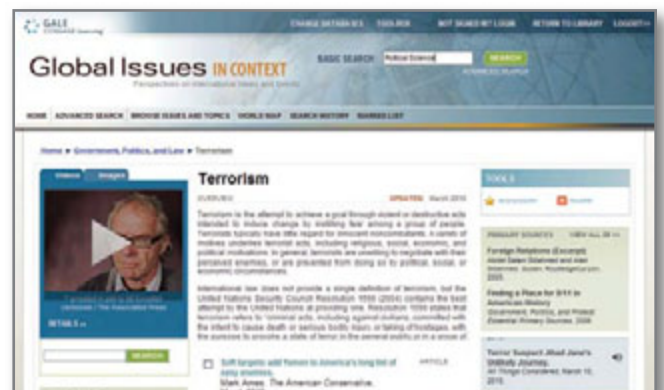
“Related Issues” broaden perspectives

Further investigation leads the student to “Related Issues” where similar topics from various viewpoints, perspectives and locations from around the world are explored. The student clicks on a link labeled “Terrorism” and it leads to additional videos, podcasts, newspapers, periodicals and reference sources related to the original search.