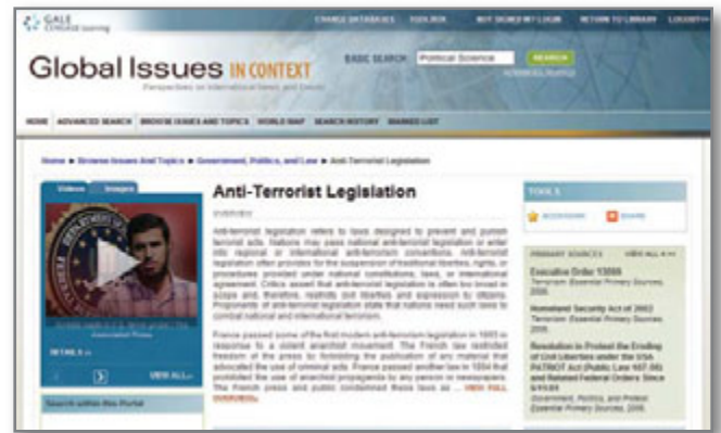
Delving deeper with “Perspectives”

Exploring deeper into the unique “Perspectives” drawn from editorials, feature articles, news reports and analyses from media sources across the globe, the student can research local views and their interpretations of issues and events. The student clicks on a podcast entitled, “Anti-Terrorist Legislation.”