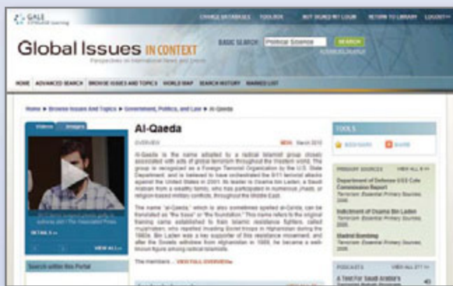
Searching “Overviews” promotes further investigation

Informed opinions include context, going beyond the surface argument and evaluating implications, making sense of complex ideas and bringing to light topics that are not easily found. As students delve into Global Issues in Context , they are compelled to look at an issue from every angle.